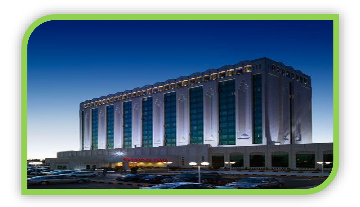
Client: Social Security Corporation